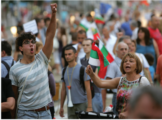
A massive protest in Bulgaria, earlier this year. Many Bulgarians are unhappy with energy, banking and media policies. In the PACITA project, Technology Assessment - as a provider of unbiased knowledge on S&T issues - was identified as an 'unrecognized need' by Bulgarian decision makers.

to the given policy context and to the expectations and demands expressed in the countries explored'. Whereas the PACITA project focuses on TA by national ('macro') authorities and policy making bodies, TA could also be practiced on the EU level (within for instance the European Commission's 'Responsible research and innovation initiative'), within ('meso') regional or local bodies, or even ('micro' level) within industrial companies or in individual research institutions.