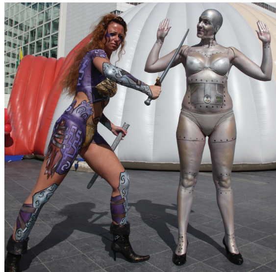
In 2010 the Rathenau Instituut was present with a robot at an art festival to stimulate the debate on new technology