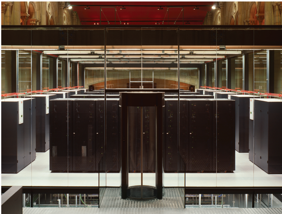
The supercomputer MareNostrum, located in an old chapel built in 1920, is one of the fastest supercomputers in the world and the main resource of Barcelona Supercomputing Center

predict the price of rice or use mobile phone top-ups to describe unemployment in Asia.